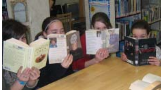
The single factor most strongly associated with reading achievement is independent reading.

The 21 st Century does not lack available entertainment. It's easy to turn on the television and not have to think about anything. But many popular movies are based on books.