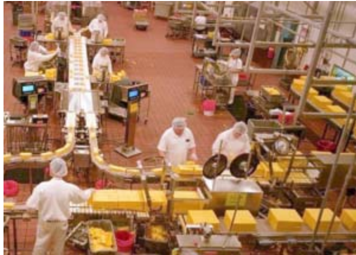
Tillamook workers slice and package boxes of jalapeno cheese.

At first, Tillamook Cheese Factory was run in a barn with only a few workers from around the town. It became a cheese factory in 1909 and only sold food out to the town and its suburbs. Now they own a HUGE factory and sell products all over the United States. They even named the high school "Cheese Makers" in honor of the factory!