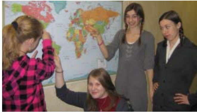
Travel to Europe with other homeschoolers via Loewen Tours.

They are also unique in the fact that they prefer to travel as the locals do, by high-speed train systems, trams,