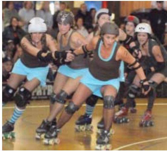
Roller Derby players

Roller Derby is a game that not all people like. So watch some and you might just find out that you really like it!