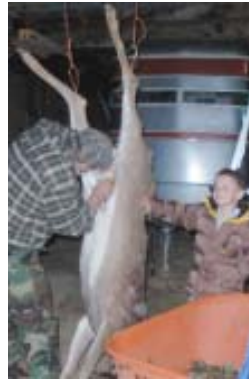
My dad skins the deer

I went in the house and to the fire. I took off my sweats to the shorts underneath. My sweats were still soaked in water from sitting on the wet ground. So next time, I will insist on a chair. Hunting is an interesting experience that I would do a million times again, as long as I take a book.