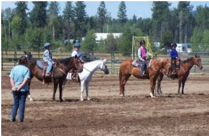
A 4-H judge looks on at the mounted youngsters.