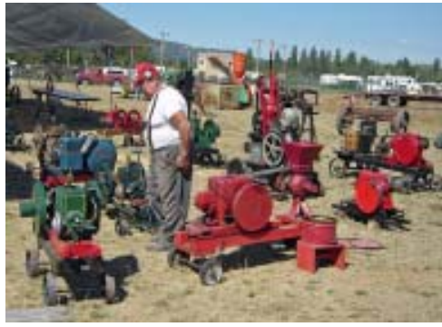
Farm implements ranging in time are enjoyed by many.