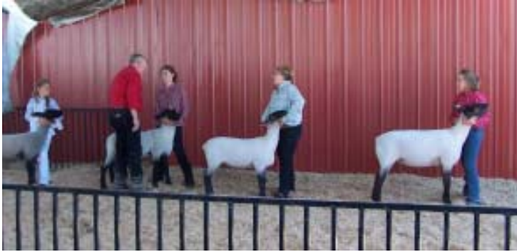
There is mighty competition with livestock, especially sheep.